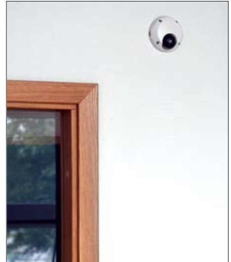
AXIS 209 MFD

DynaPel Systems, a leading developer of digital video analytics appliances, smart cameras and networked digital video recorders in Europe, explored expansion opportunities at Intersec for its dealership